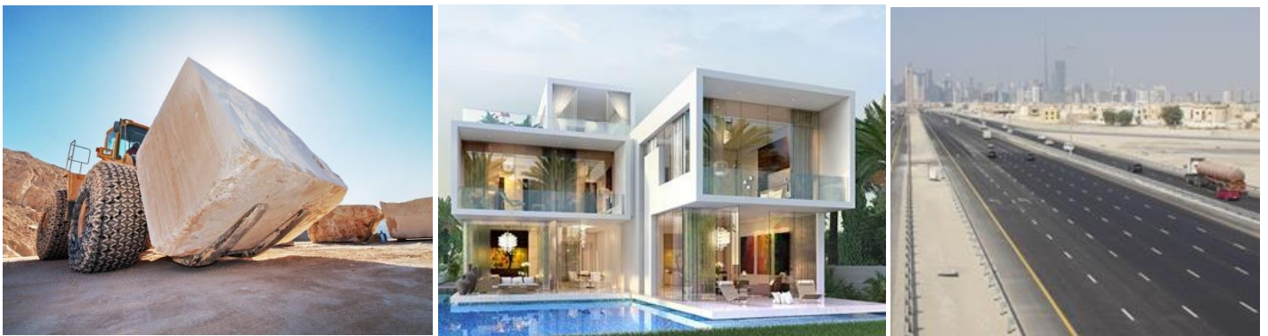
The GCC accounts for 20% of the global stone market. Economically, that is said to be worth in excess of US$5 billion-a-year. Across the region, urban construction accounts (middle and right) for 80% of all stone usage

Along with its stone procuring opportunities, Middle East Stone will once again host three-days of CPD-certified workshops and talks at its ever popular Stone Conference. The Live Product Demonstration, an interactive display of the most innovative products and technologies in the stone and fit-out industry, will give visitors the opportunity to get a first-hand experience of the products and services reshaping the construction and stone industry too.